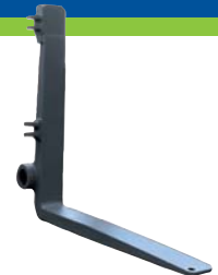
Hydraulic Attachment Fork