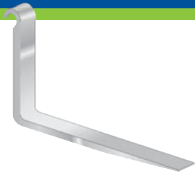
Quick Disconnect Fork